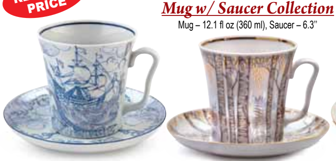
Mug - 12.1 fl oz (360 ml), Saucer - 6.3"