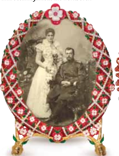
Flowers Fabergé Style Picture Frame enamel, glass, 5.9x7.9" 125892 $89.99

This first Easter Egg, the Hen Egg, marked the beginning of one of the most beautiful historical Russian traditions. Since then, the famous jeweler delivered one or more of his gorgeous surprise eggs to the Imperial Family every following Easter, creating a tradition that became famous the world over.