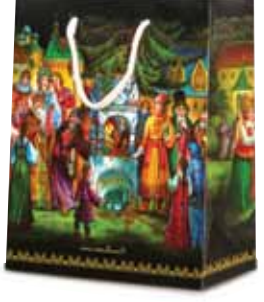
Pushkin's Fairytales Gift Bag Cardboard, 7.5x8.7x4" 126495 $1.49