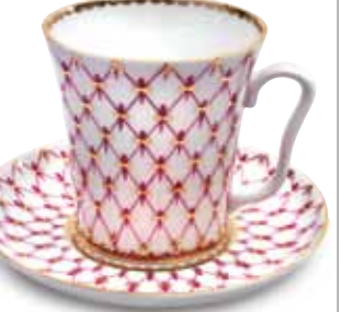
Net-Blues 113969 $39.99