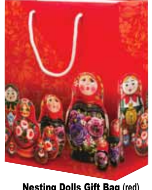
Nesting Dolls Gift Bag (red) Cardboard, 10.5x13x5.5" 122442 $1.99