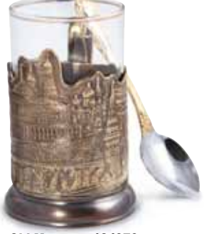
Old Moscow 134970